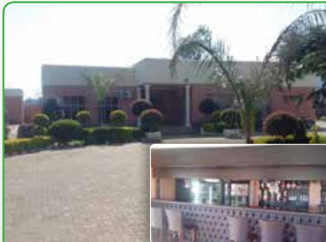
Bana Ba Mahlako /Ga Kalane Pub and Jazz Club